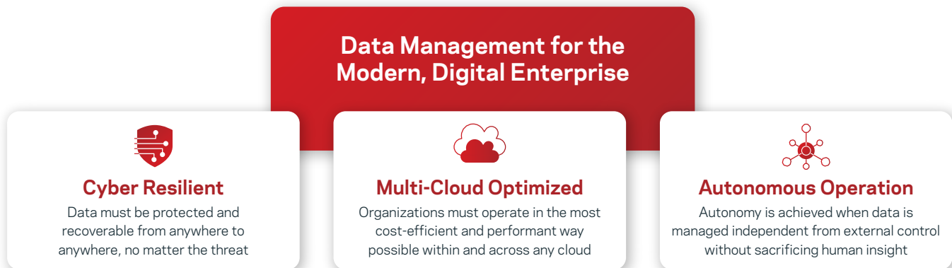
Figure 4. The core characteristics for the future of data management.

Enterprises in pursuit of digital transformation are accelerating their multi-cloud strategies. Yet, today's enterprise data management solutions are ill-equipped to meet the challenge of managing and protecting their data in multi-cloud environments. Veritas NetBackup, powered by Cloud Scale Technology is delivering the industry's first AI-powered autonomous data management solution delivered on a cyber-resilient, multi-cloud-optimized, and ultimately autonomously operated platform (See Figure 4).