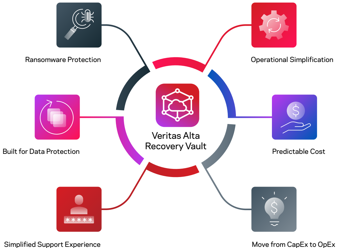
Figure 1. Why Veritas Alta Recovery Vault?

Veritas Alta Recovery Vault customers can protect their NetBackup™ compressed and de-duplicated data in a secure Veritas tenant hosted by several cloud service providers (CSPs). Most storage as a service (STaaS) providers have adopted a shared responsibility model, which makes it clear that the providers will not take any action to protect customers' data. The job of protecting the data in the CSP is completely the responsibility of the customer. Customers who adopt Veritas Alta Recovery Vault see complete backup and recovery of all their application data, fast and flexible data recovery, and secure and flexible provisioning.